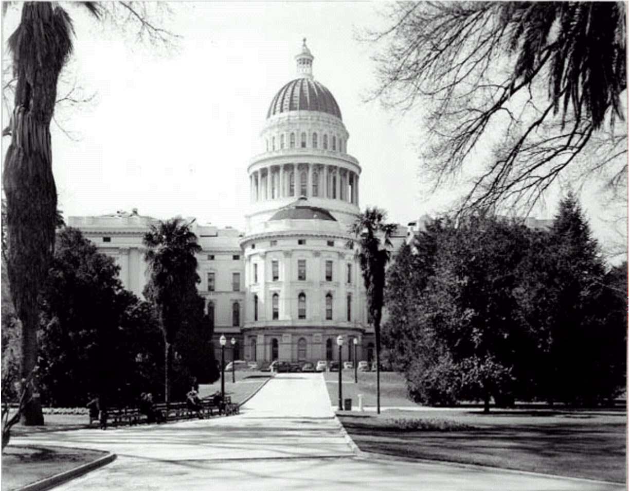
State Capitol Building (from the East) c.1945