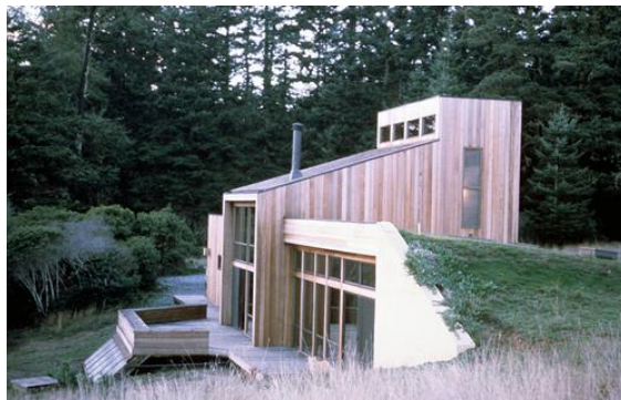
Figure 4. Passive Solar Architecture 36

Figure 4 provides an example of a passive solar residential structure.