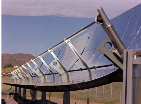
Figure 8. Parabolic Trough Collector

Process heating, used in industrial environments, generally requires the development of much higher temperatures for the production of steam or high heat. Figure 8 shows a parabolic trough system, where a highly reflective parabolic surface concentrates sunlight upon a central liquid-carrying tube. Systems like this are capable of producing process heat and steam in the temperature range of 200° - 400°F.