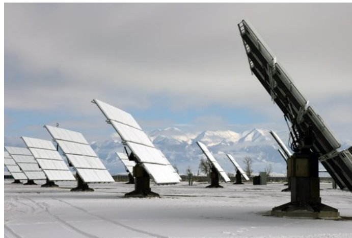
Figure 2. Solar Tracking PV Array

Figure 2 provides an example of a large scale photovoltaic system.