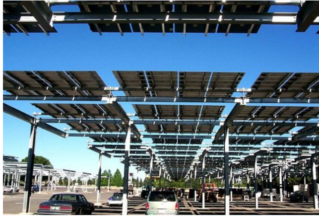
Figure 3. Solar parking lot canopy

Figure 3 shows an example of a solar parking lot canopy.